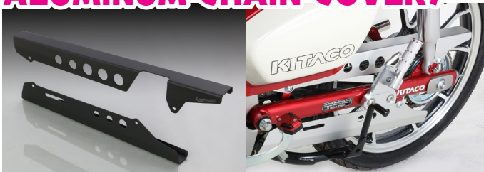
Dress-up with aluminum alumite finish chain cover in style.