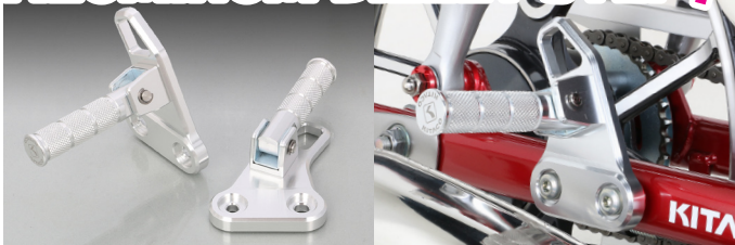
Dress-up with aluminum machined billet type step.