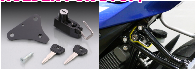
Helmet lock to tighten with tandem step (leftside). For commuting, touring and leisure convenient life.