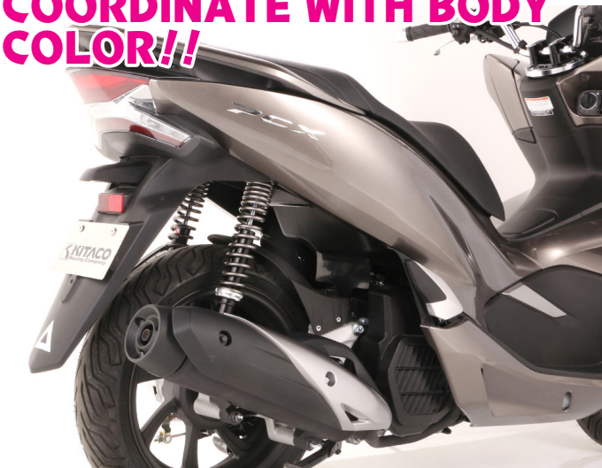
Rear shock absorber for sport ride newly released. 3 colors for vehicle colors newly released !!

REAR SHOCK ABSORBER FOR SPORT RIDE! COORDINATE WITH BODY COLOR!!