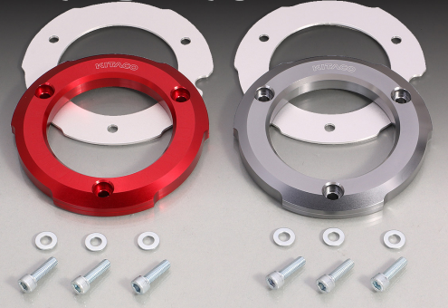
Just exchange with stock R protector cover (resin). Makes cool looking with aluminum machined case.