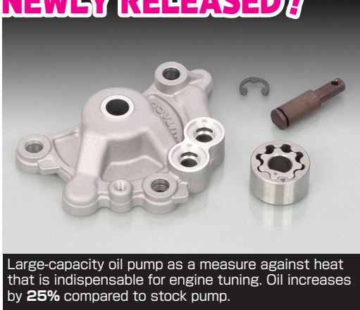
Large-capacity oil pump as a measure against heat that is indispensable for engine tuning. Oil increases by 25% compared to stock pump.

OIL INCREASES BY 25%! SUPER OIL PUMP KIT NEWLY RELEASED!