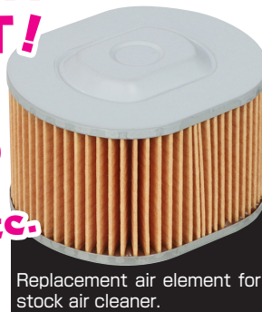
Replacement air element for stock air cleaner.

'92 ~ '99 SUPER CUB 50 '88 ~ '99 PRESS CUB 50 '97 ~ '99 LITTLE CUB etc.