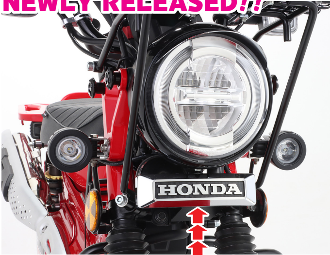
FRONT EMBLEM KIT (UNDER DEVELOPMENT)