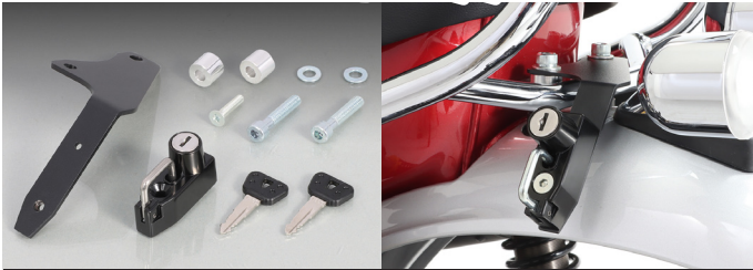
Tightens with grab bar. Very convenient for short trip or touring!