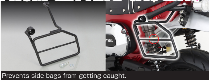
Prevents side bags from getting caught.