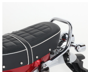
STOCK GRAB BAR