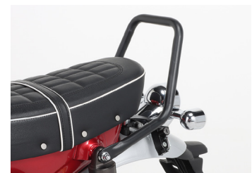
HIGHER GRAB BAR (75mm)