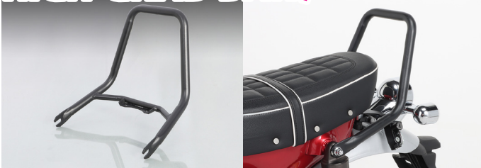
High grab bar that does not break the DAX125 custom style.