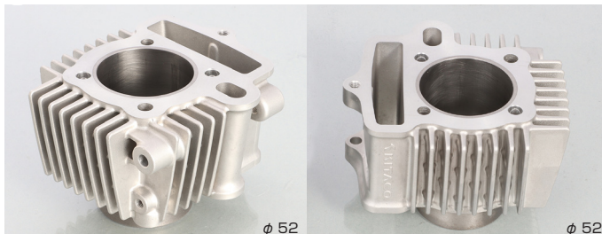
Lightweight aluminum cylinder block with casting sleeve cylinder.