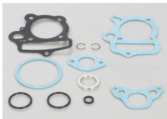
Replacement gasket set for the parts such as cylinder / cylinder head.