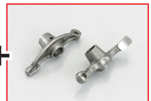
88cc NEW STD BIG BORE KIT (with camshaft)