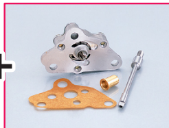
ULTRA OIL PUMP SET CODE : 331-1013500 PRICE : ¥6,800