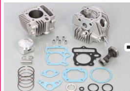
88cc NEW STD BIG BORE KIT (with camshaft)

MONKEY/GORILLA (FN0.Z50J-1600008~1805927/APPLICATION B)