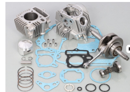
108cc NEW STD BIG BORE KIT (with camshaft)