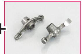
ROCKER ARM SET CODE : 303-1133770 PRICE : ¥2,200