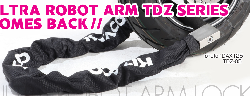
photo : DAX125 TDZ-05