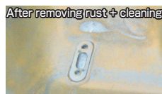
After removing rust+ cleaning Cleaned. Removes rubber, resin and deposits.