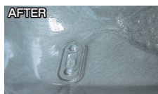
AFTER Coats completed with sealer.