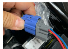
Remove 4P coupler cap and install power supply extract kit type 2