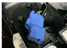
Take out 4P coupler in connector cover under the seat.