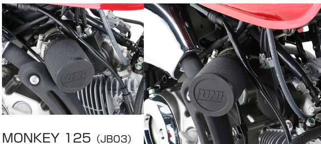
MONKEY 125 (JB03)