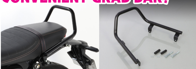
Slightly HIGH grab bar that does not spoil the style of the GB350S ※