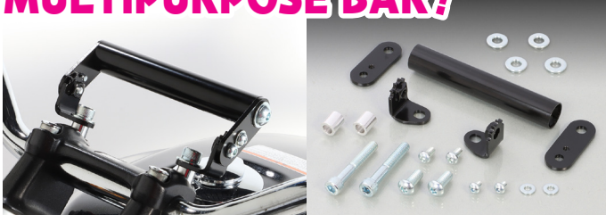
Multipurpose bar that can be changed in 5 steps (35°)