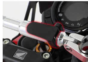
PHOTO : HANDLE BRACE

LCD DIGITAL TERMOMETER SIZE : W63 × H14 × D32(mm)