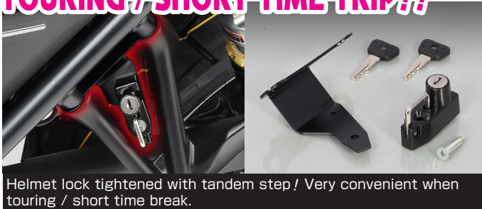
Helmet lock tightened with tandem step! Very convenient when touring / short time break.