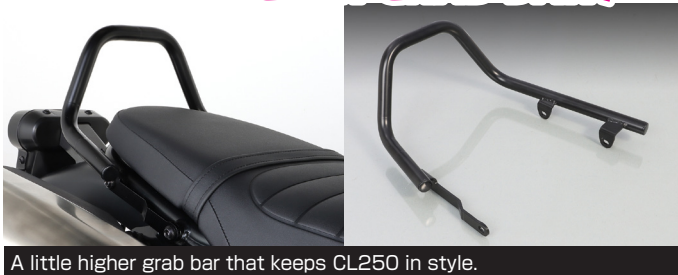
A little higher grab bar that keeps CL250 in style.