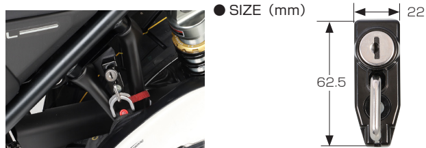
※ Do not drive with helmet holder on.