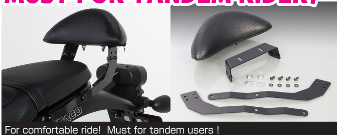
For comfortable ride! Must for tandem users!