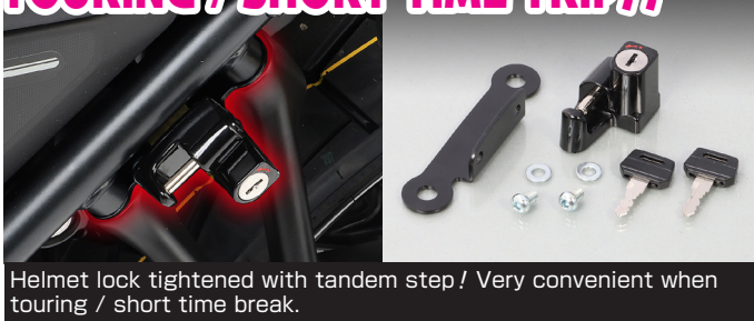
Helmet lock tightened with tandem step! Very convenient when touring / short time break.