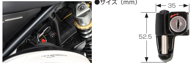
※ Do not drive with helmet holder on.