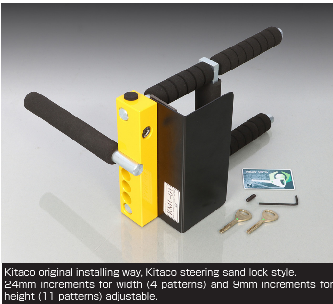
Kitaco original installing way, Kitaco steering sand lock style. 24mm increments for width (4 patterns) and 9mm increments for height (11 patterns) adjustable.