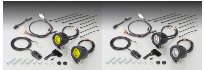
Led shuttle beam with compact body and brightness with frame side mount next to the radiator newly released.