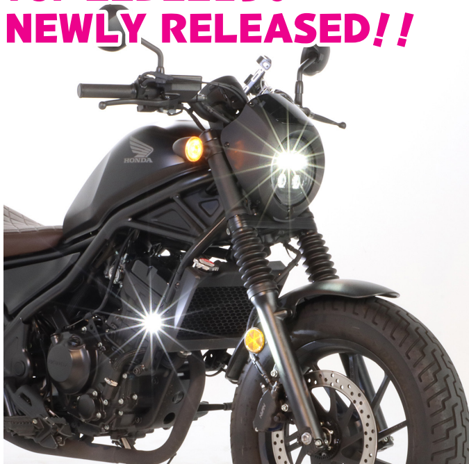
Best place for installation LED shuttle beam is mounted next to radiator.