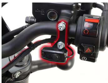
On / off switch for LED SHUTTLE BEAM is tightened with brake master cylinder.