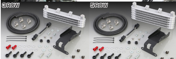
Must to protect engine from heat ! 3 row or 5 row are newly released !