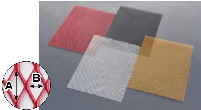
FINE TEXTURE / A : 8 × B : 4 (mm)

FROM MINI TO BIG MOTORCYCLE, SCOOTER & CUSTOM MODELS! DRESS-UP ANYTHING WITH YOUR IDEA !! FINE / MIDDLE MESH NEWLY RELEASED!!