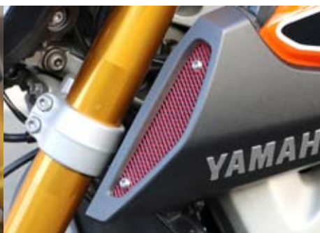
MT-09 AIR SCOOP DUCT