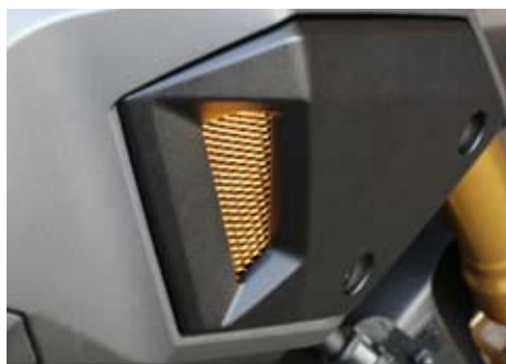
GROM AIR DUCT