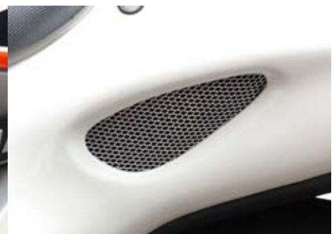
HAYABUSA SEAT COWLING