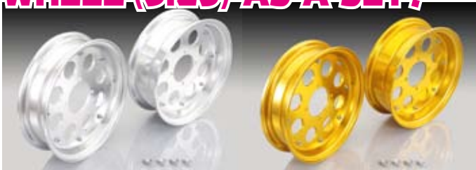
STD wheel (2.50) & WIDE wheel (3.25) as a set newly released.