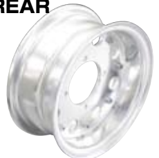
WIDE (8 x 3.50) COMPATIBLE TIRE SIZE DURO 110/80-8 DURO 120/70-8