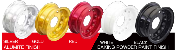
SILVER GOLD RED WHITE BLACK ALUMITE FINISH BAKING POWDER PAINT FINISH