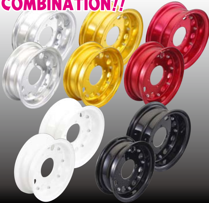
A set of 8" aluminum wheel with different size (2.50/3.50-8). 5 colors (SILVER / GOLD / RED with alumite finish, WHITE / BLACK with baking powder paint) available.