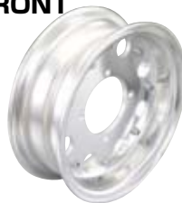
STANDARD (8 x 2.50) COMPATIBLE TIRE SIZE DURO 3.50-8