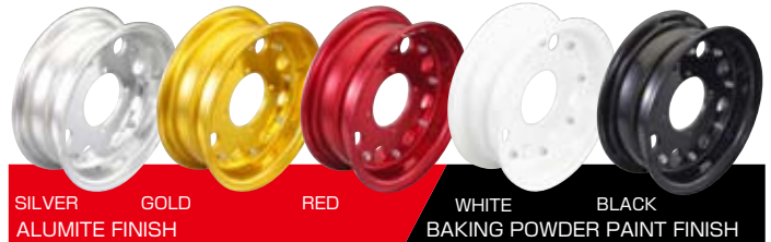
SILVER GOLD RED WHITE BLACK ALUMITE FINISH BAKING POWDER PAINT FINISH