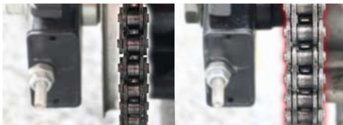
420 SIZE (ROLLER LINK WIDTH : 6.35mm) 428 SIZE (ROLLER LINK WIDTH : 7.94mm)