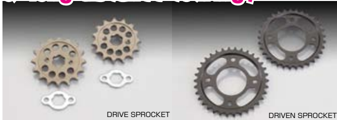
DRIVE SPROCKET DRIVEN SPROCKET

Reinforces chain! For high-tuned motor & long distance touring!