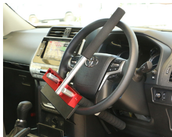
LAND CRUISER PRADO