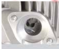
COMBUSTION CHAMBER INTAKE PORT φ 22mm EXHAUST PORT φ 18 mm

Making the inside wall surface smaller, flame propagation becomes shorter which improves volumetric efficiency. Standard big bore cylinder head type 2 has hemisphere shape, cross-flow type combustion chamber & fillet fins for intake/exhaust flow efficiency.