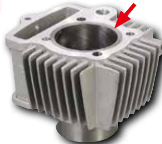
ALL HARD CHROME PLATED