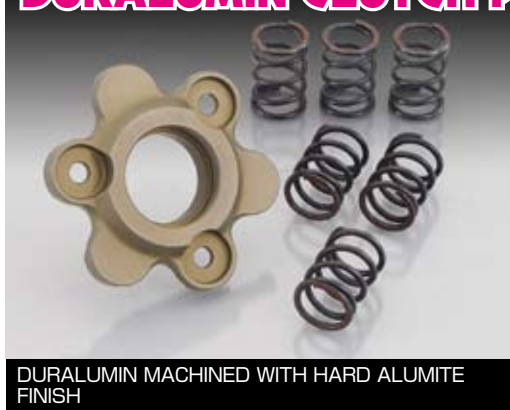
DURALUMIN MACHINED WITH HARD ALUMITE FINISH