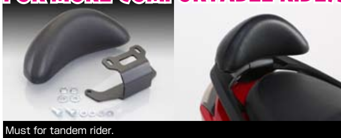
Must for tandem rider.