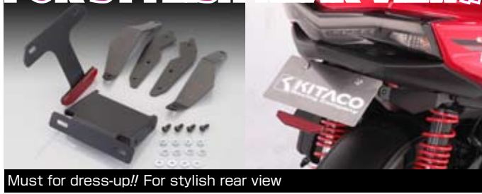
Must for dress-up!! For stylish rear view