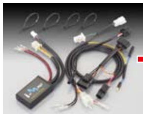
I-MAP COUPLER-ON SET