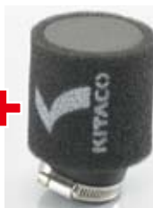
SUPER POWER CLEANER (φ 35) 515-6000350 ¥2,800