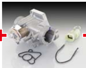
BIG THROTTLE BODY SET