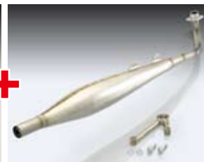
CLASSIC DOWN MUFFLER STAINLESS STEEL : 544-1429440 ¥35,000 TITANIUM : 544-1429770 ¥58,000