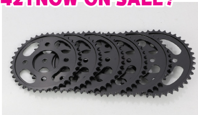
2021 KITACO NEW PRODUCTS Vol.11