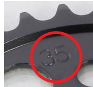
Teeth stamped side is front side.

* Speed pulse convert unit is required when changing sprocket teeth (except stock 38T). Purchase speed pulse convert unit (Vol.16-1) separately. * Inspect every 1,000km and exchange when found tapered.