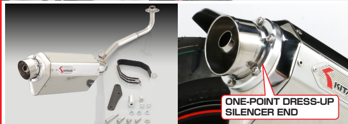
ONE-POINT DRESS-UP SILENCER END

Sport muffler with hex-shaped silencer. High output expected at middle-high rpm range.