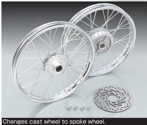
Changes cast wheel to spoke wheel.

※ Stock caliper usable. 2P caliper assy (RED : 500-1310220) is installed on the model above.