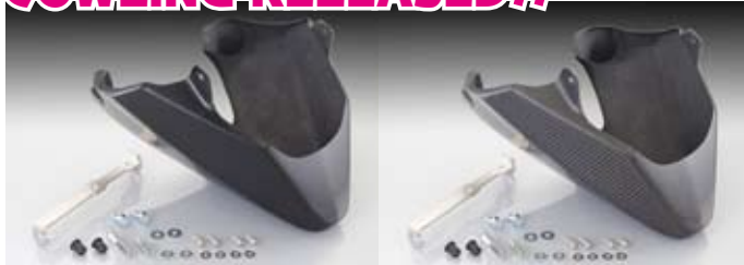
Shorty street under cowling is newly released. Compact and cool looking!