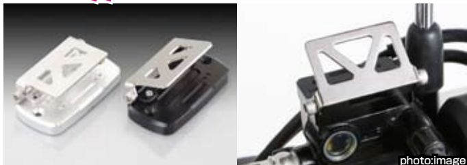
Type 3 has movable meter stay on the top. Angle adjustable for the best meter position.

Tightens meter stay into any of on the master cylinder cap.