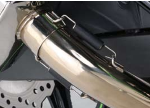
EXTREME-R MUFFLER Z125-PRO

Protects muffler spring from vibration for durability!!