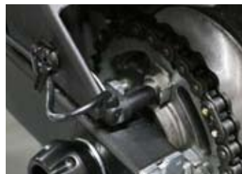
SPEED SENSOR INSTALLED!!

※ It is not 100% water-proof. Keep it somewhere it does not get wet. ※ Precision screwdriver is required when opening the lid.