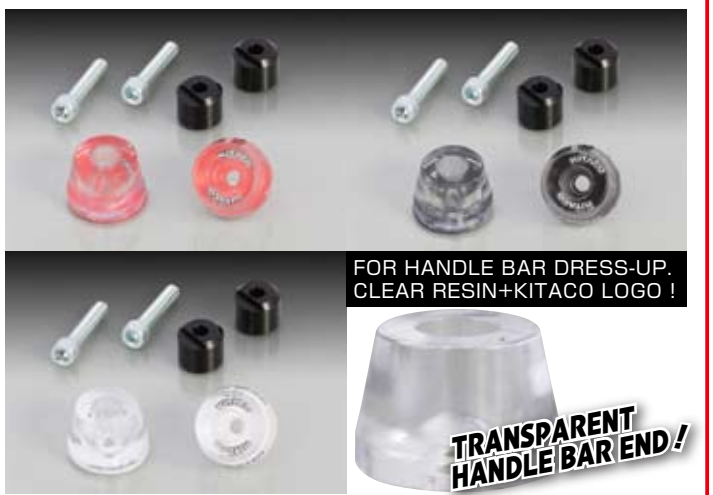
FOR HANDLE BAR DRESS-UP. CLEAR RESIN+KITACO LOGO !