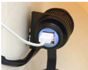
Uses accessory battery (ACC+). It turns on when key is on. Built-in blue LED turns on.