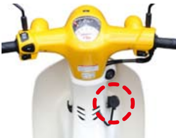
Installs inside the right side leg shield.

To prepare for battery supply for cell phone and etc. Just insert between coupler to get ACC⊕, ground⊖