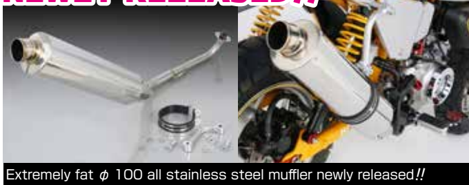
Extremely fat φ 100 all stainless steel muffler newly released!!

φ100 STAINLESS STEEL SILENCER!! DOWN TYPE EXHAUST NEWLY RELEASED!!