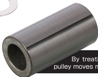
By treating DLC coating, pulley moves more smoothly.