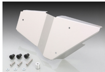
Left side cover which has same look as right side cover newly released. Dress-up with your favorite stickers!