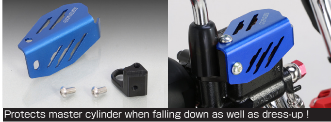
Protects master cylinder when falling down as well as dress-up!

PROTECTS WHEN FALLING DOWN & DRESS-UP! MASTER CYLINDER GUARD IN BLUE NEWLY AVAILABLE!!