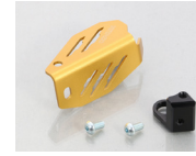
MASTER CYLINDER GUARD GOLD CODE : 500-1300970 PRICE : ¥3,000