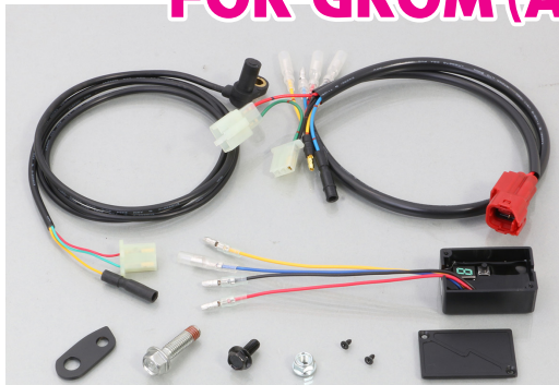
With Kitaco sensor, it will be able to read pulse from front wheel disc rotor bolts for stock meter. Also, it converts pulse for stock meter.