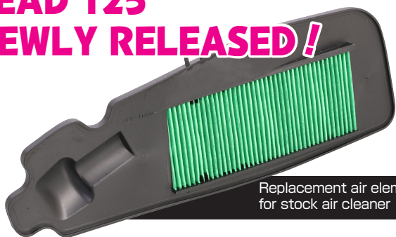
Replacement air element for stock air cleaner