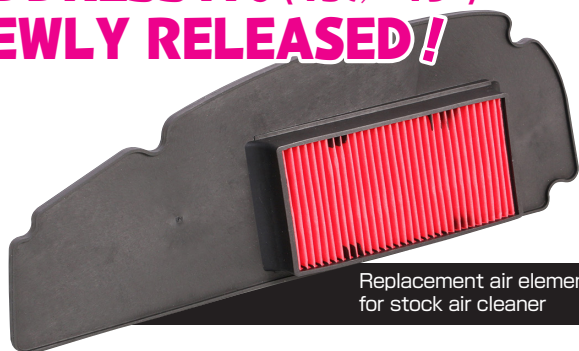
Replacement air element for stock air cleaner