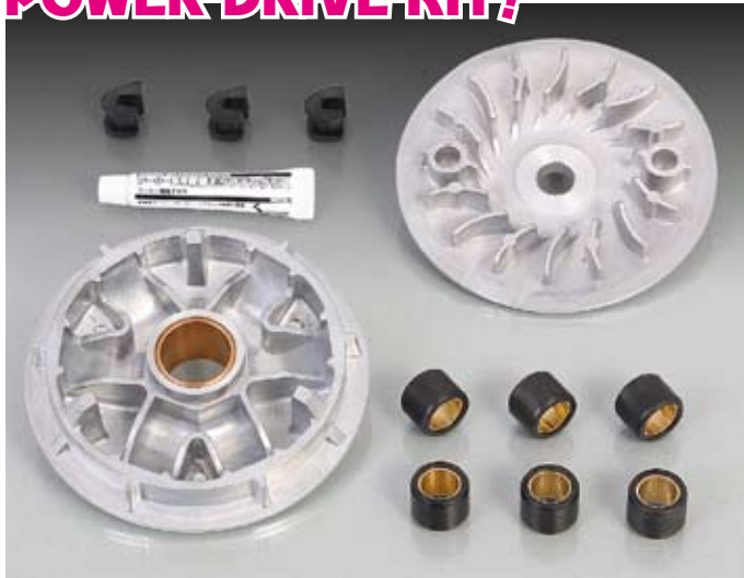
A set of pulley, drive face, rollers and sliders. Lightweight / reinforced / larger O.D. with originally designed roller guide !