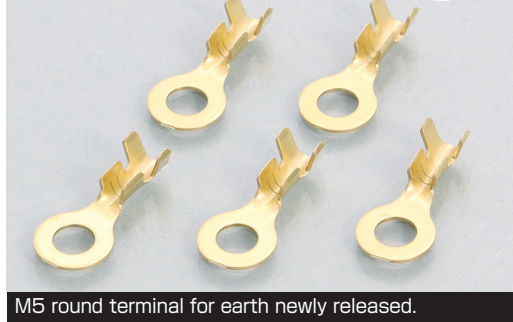
M5 round terminal for earth newly released.