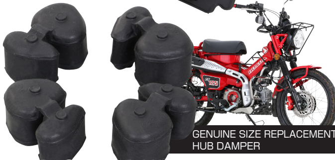
GENUINE SIZE REPLACEMENT HUB DAMPER

※ Filter color might be changed without previous notice.