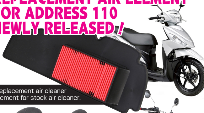
Replacement air cleaner element for stock air cleaner.