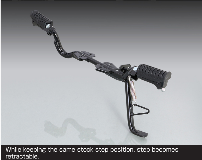
While keeping the same stock step position, step becomes retractable.