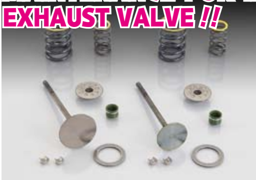
A maintenance set for intake / exhaust valve parts for Kitaco SE-PRO cylinder head