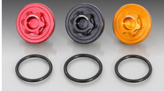
Dress-up oil strainer cap.

Installing tool width will be change to 22mm from 17mm.